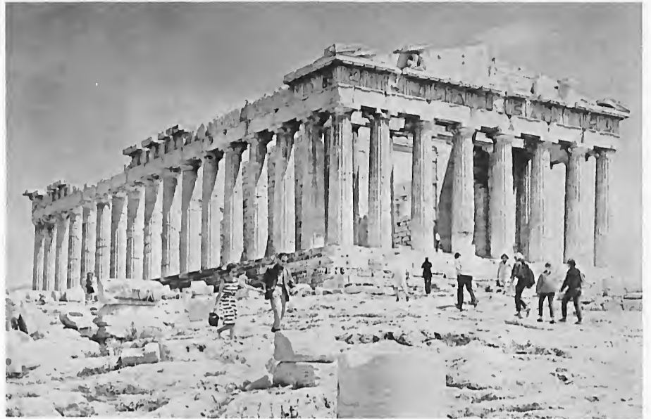
The Parthenon, an ancient Greek ruin in Athens.

The glory that was once Greece's can be observed first hand in a tour of Athens being offered by Gardner-Webb College.